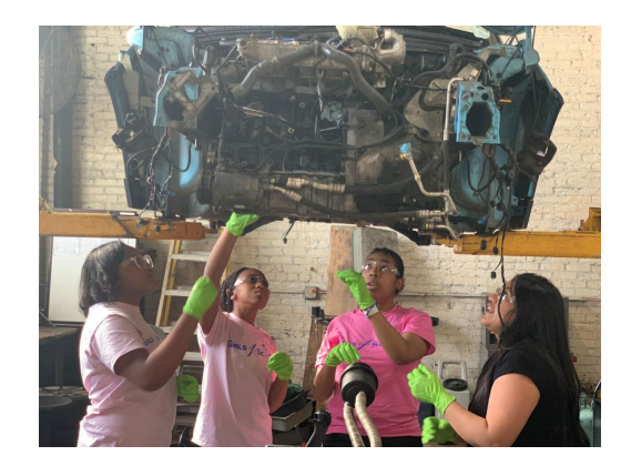
Photo (below): Girls 4 Science participants get a preview of The Science of Cars

Transportation will be provided from Olive Harvey Community College, Malcolm X Community College and the University of St. Francis.