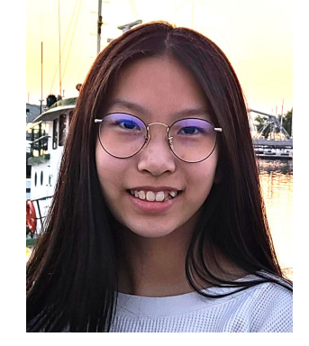
Carly Mg Malcom X College